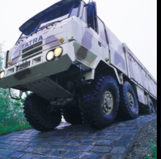
The Twin Disc TD-61-1175 Integrated Vehicle Automatic Transmission System provides the driver of this Tatra all-wheel drive truck with superior control under grueling terrain conditions.