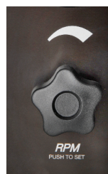
Pictured Above: Rotary digital throttle with push-to-set speed selector allows for changes to Auto-start Operate RPM within pre-defined operational limits