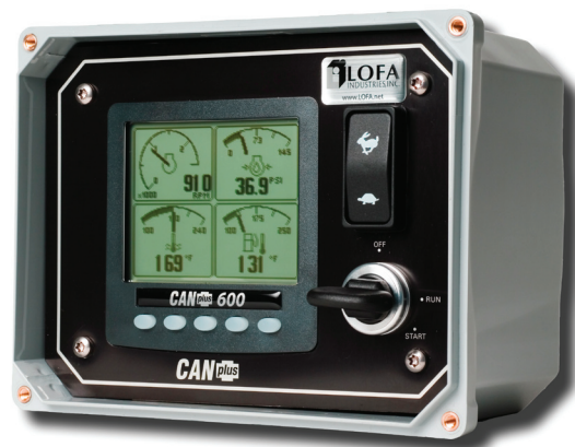
Pictured Above: CP600

The standard panel terminates to a sealed Deutsch weatherproof plug. This connector offers a robust connection that performs well in harsh environments and allows for simplified installation. The design allows installing custom plug-and-play engine wiring harnesses as well as standard harness extensions.