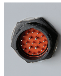
Pictured Above: Deutsch 21 pin engine harness connector