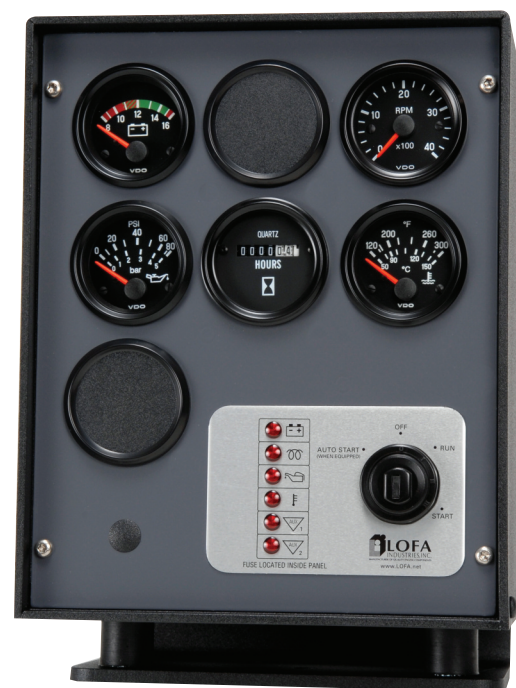
Pictured Above: EL240 G7

The EL240 series panel is a flexible platform for mechanically governed diesel engine control, monitoring, and protection, featuring LOFA's powerful First Fault Diagnostics (FFD). After pinpointing the initial failure, FFD stores the shutdown in memory and alerts the operator, via a single bright LED, of the exact cause of the failure. This feature helps identify failures quickly and reduces downtime for the customer. The microprocessor-based solid-state design uses reliable high-power semiconductors instead of outdated electromechanical relays.