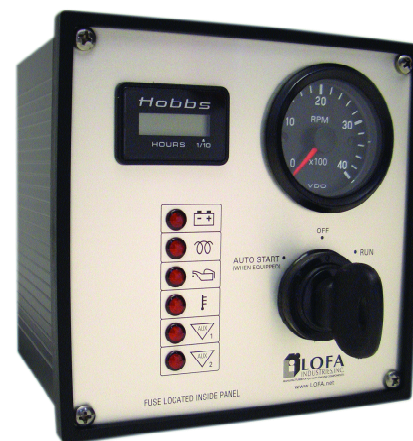
Pictured Above: EP250 G1